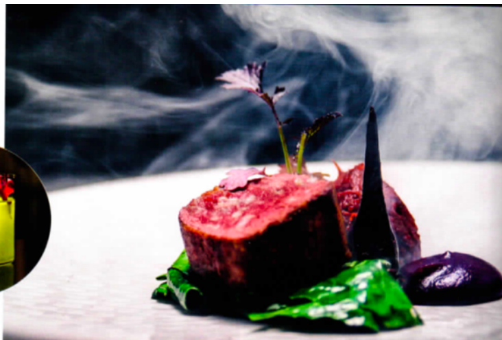
Hiran aachaar at Opheem