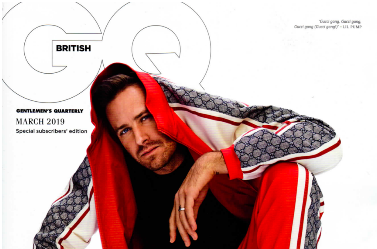
'Gucci gang, Gucci gang, Gucci gang (Gucci gang!)' - LIL PUMP

DATE: 7.2.19 PUBLICATION: GQ Magazine CIRCULATION PRINT: 125K