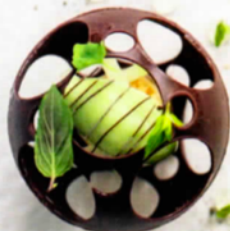
From top: A Wong; the Hemp at Waeska; chocolate dessert at Launceston Place

Last year the GQ Food & Drink Awards, presented by Veuve Clicquot, received thousands of suggestions from across the country. Now in its fifth outing – and following another record response – the search for the next winners comes down to our panel of judges. Here is the shortlist, plus the men and women who will decide who is the best of the best in 2019.