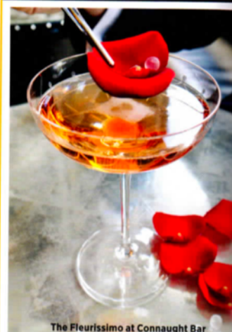
The Fleurissimo at Connaught Bar